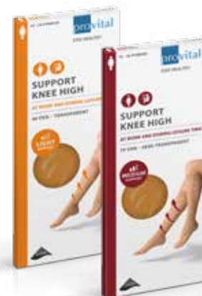
SUPPORT KNEE HIGH