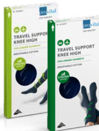
TRAVEL SUPPORT KNEE HIGH

The way a support knee high works is as simple as it is effective. The outwardly-acting, precisely defined, mechanical pressure profile working from the ankle upwards in a decreasing manner naturally causes a reduction of the venous diameter. The venous valves can close better, which means better blood circulation. During movement, the support knee high also provides muscle resistance, which can therefore work more effectively.